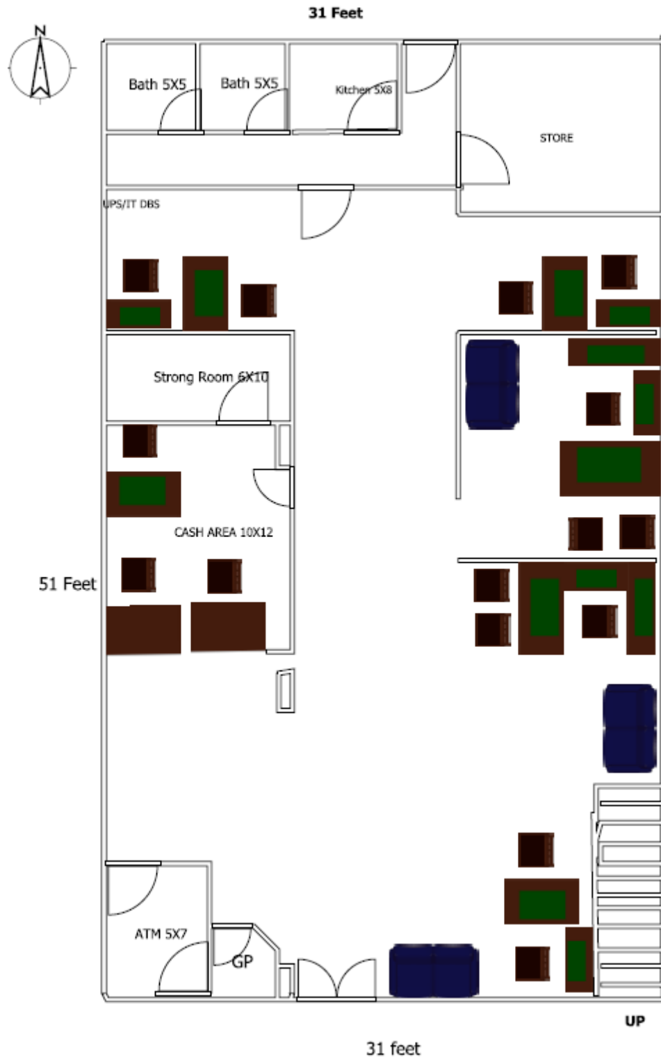
PROPOSED KORANGI BRANCH