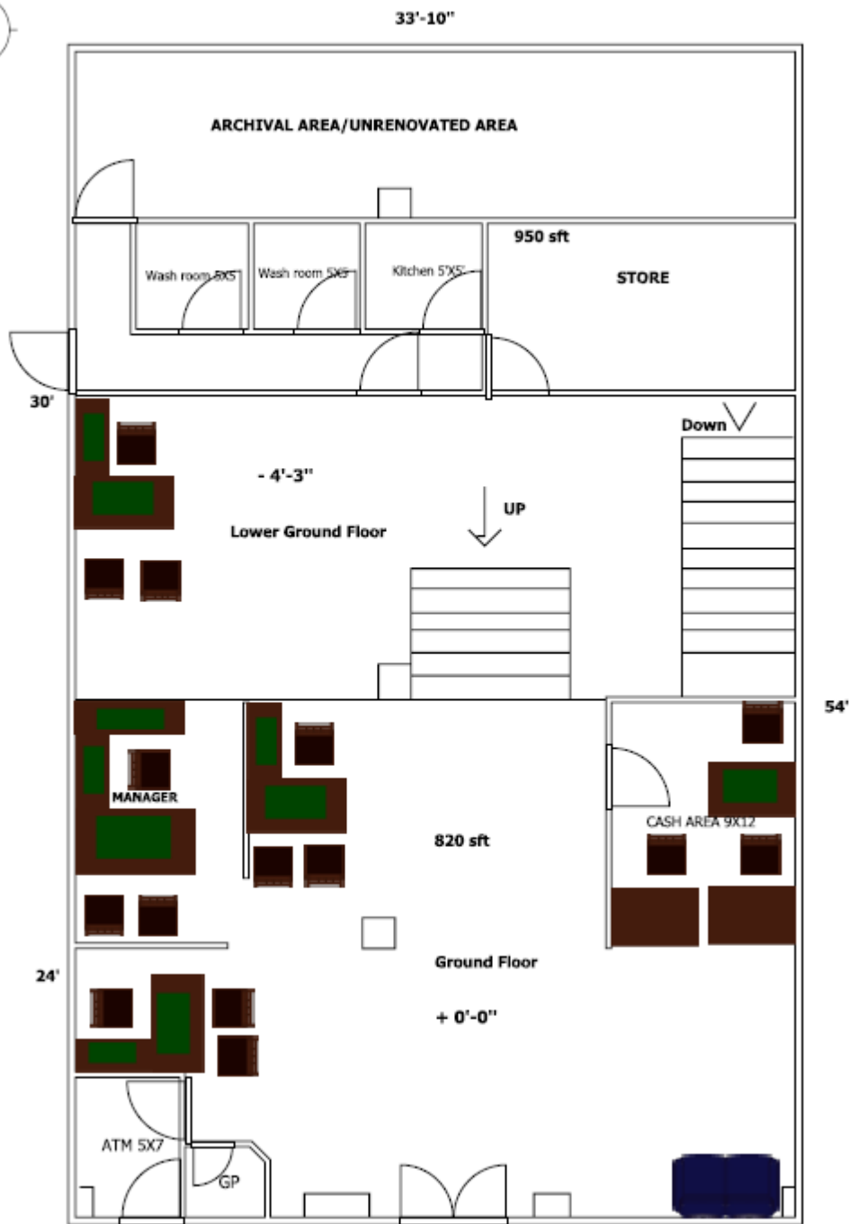
PROSED SABZAZAR BRANCH LAHORE