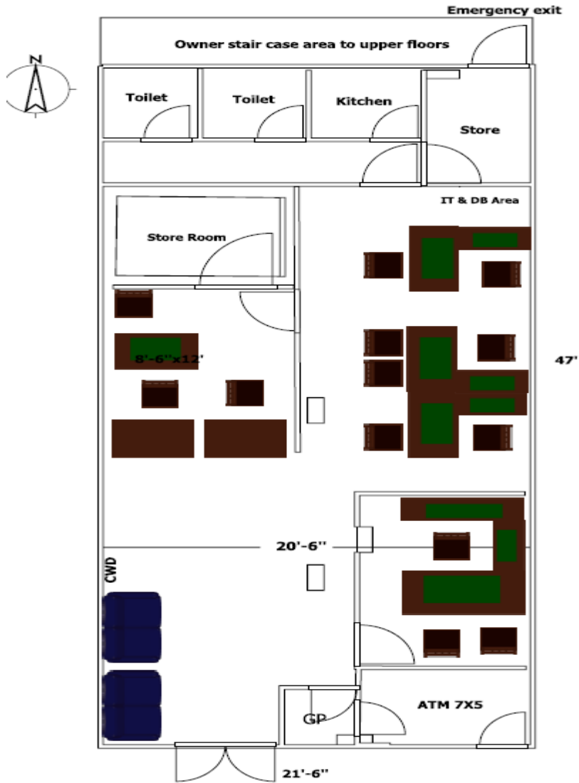
PROPOSED PREMISES SAMNABAD GULBERG BRANCH KARACHI