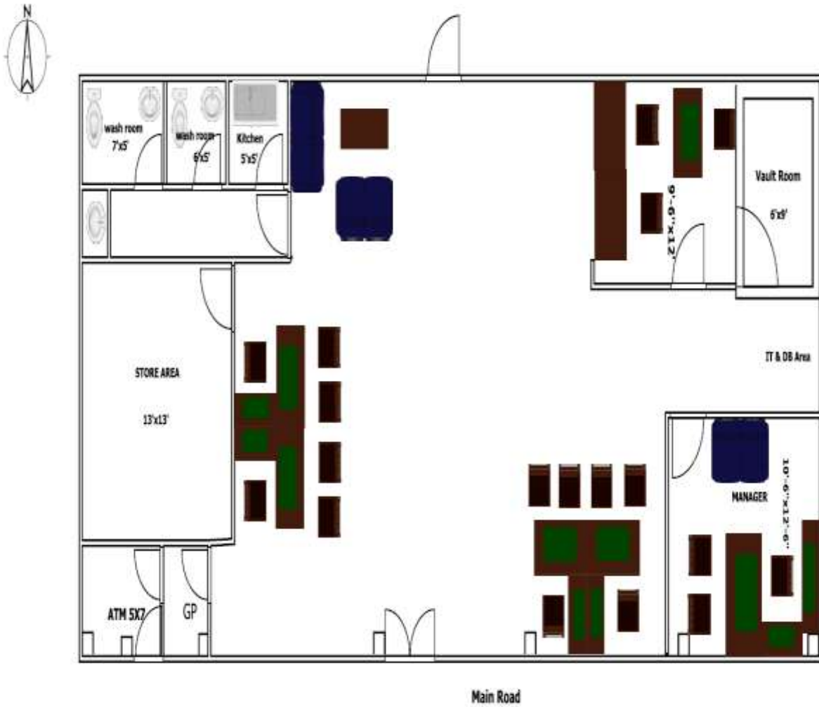
Proposed Airport Road Branch Quetta