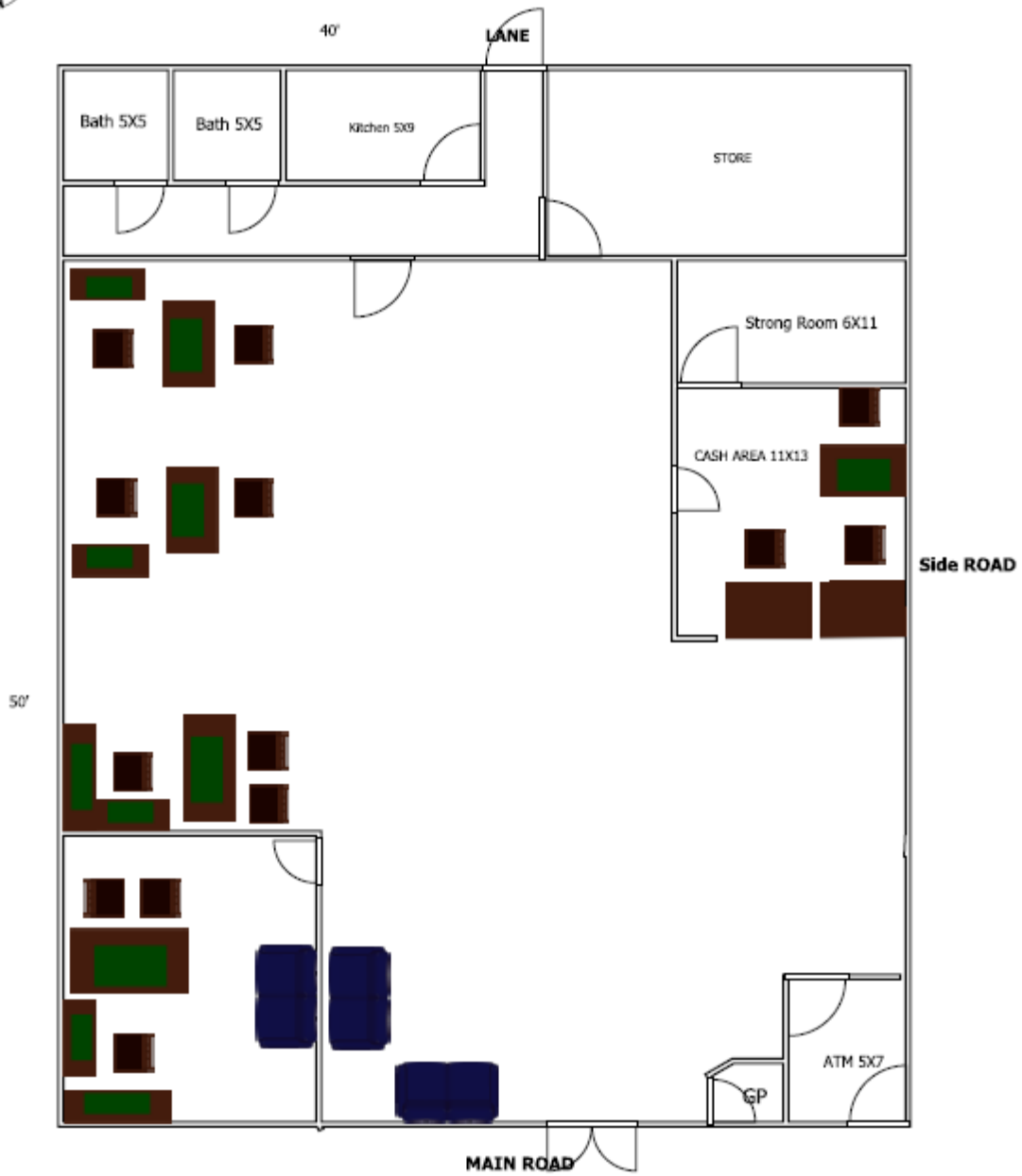
PROPOSED SHEKHUPURA RD GUJRANWALA